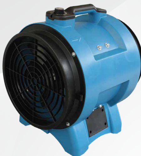
X-12 12" Diameter Air Outlet

XPOWER's Confined Space Fans can handle any narrow space with 8" or 12" diameter flex hoses ducting air up to 125 ft. Like all XPOWER products, the X-8 and X-12 are exceptionally lightweight and compact. Their low amp and powerful, sealed motors can efficiently deliver dry air to ventilate, create negative air pressure or simply to help complete any drying process for a wide variety of construction applications.