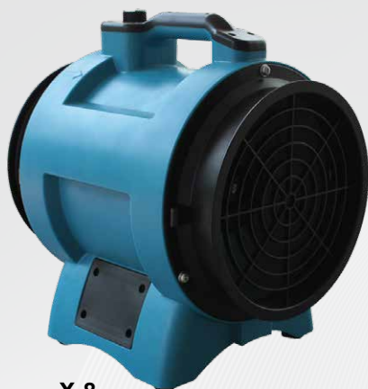
X-8 8" Diameter Air Outlet