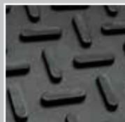
Front Side Tread