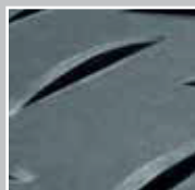
Diamond Plate Tread