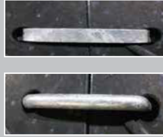
Galvanized Turn-A-Link: Single or Double